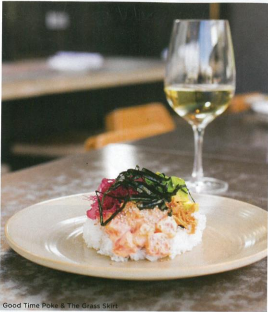
Good Time Poke & The Grass Skirt