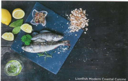
Lionfish Modern Coastal Cuisine