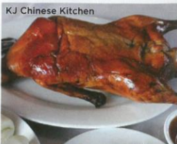
KJ Chinese Kitchen