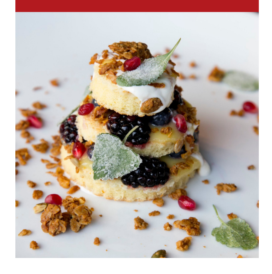
Brunchfaced, Holiday Edition